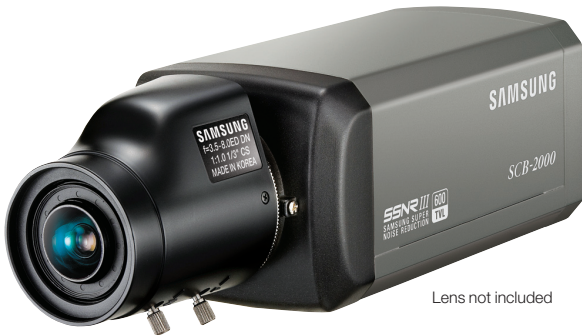
Lens not included